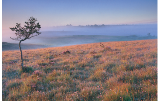
The rolling heathlands of the Open Forest at Stone Quarry Bottom near Godshill.